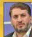
Mehran Fatemi Governor of Yazd

Yazd is the second exporter of products in this sector with the production of over 400 million cubic meters of various types of tiles and ceramics. Discovering new markets and entering them, producing the machinery needed by this industry and production efficiency and smartening the tile and ceramic industry are among our strategies and plans for the development of this field.